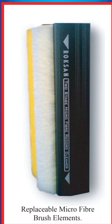
Replaceable Micro Fibre Brush Elements.

Only use record cleaning fluids when the fluid is fully removed or dried by a dedicated record cleaning machine, otherwise your stylus and your records may permanently get damaged.